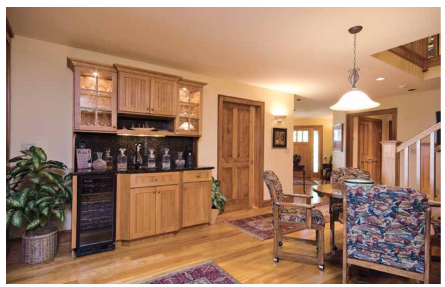
Fournier Builders crafted this custom bar

architects and Fournier himself is critical to the success the builder continues to enjoy in accommodating even the most meticulous homeowners. With a "marketing program" based solely on referrals and void of advertising, Fournier depends on the formation of relationships with each client.