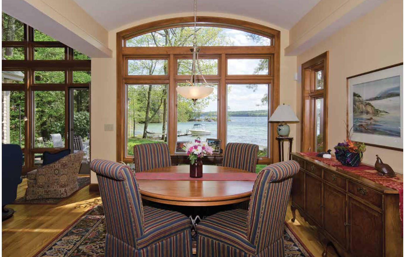
Floor-to-ceiling Pella windows allow the homeowners to enjoy natural light and lake views.