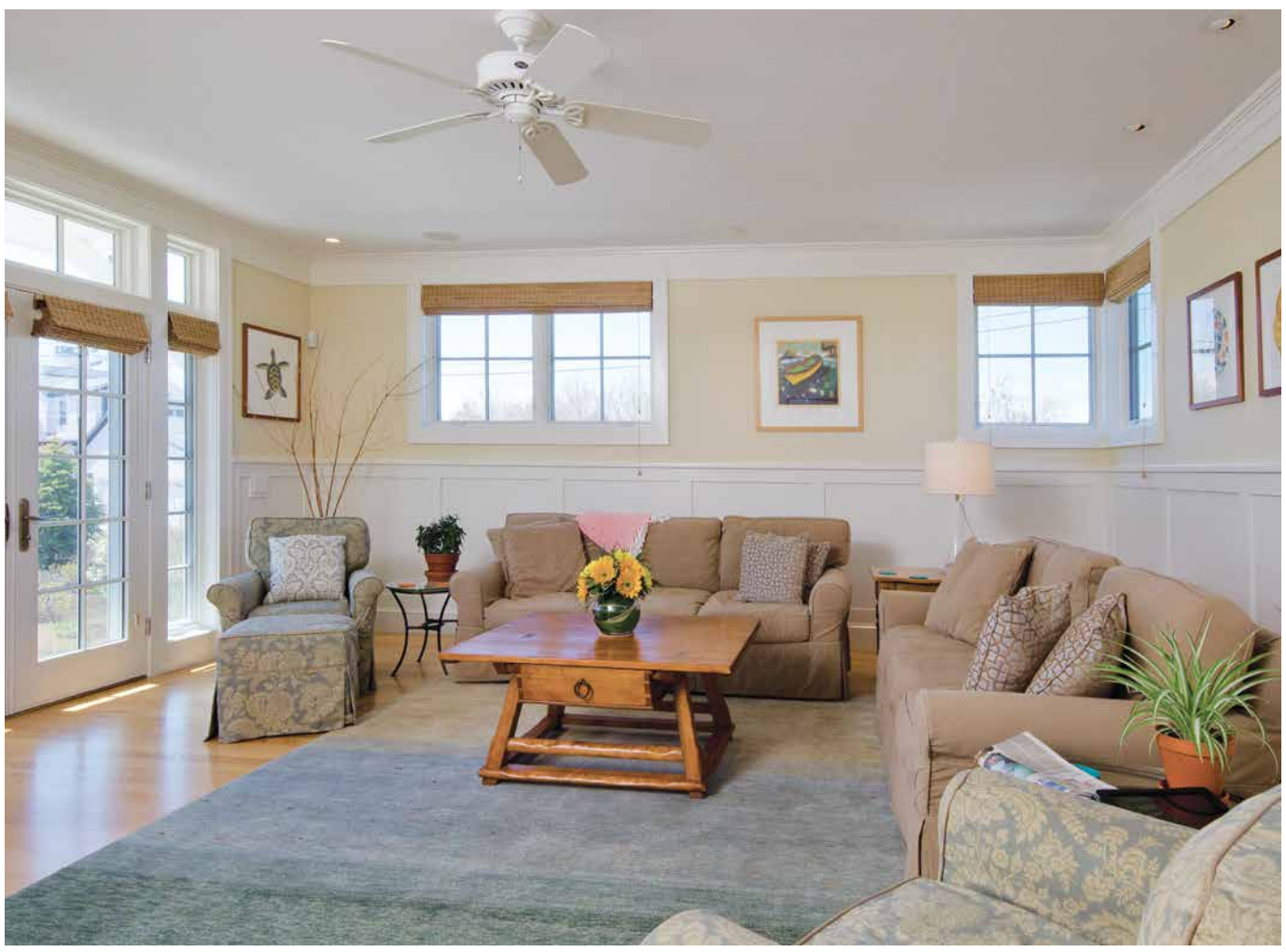
This comfortable family room features a custom, built-in sound system and fireplace.