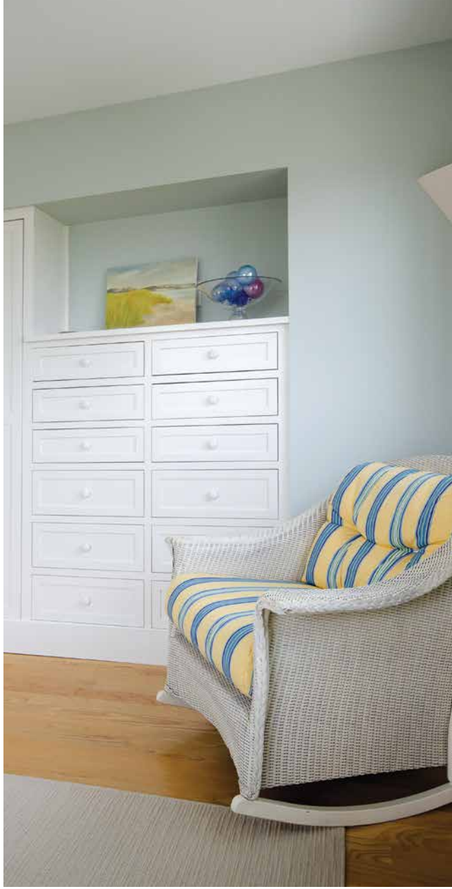
Custom built-in cabinetry by Above Board Woodworks