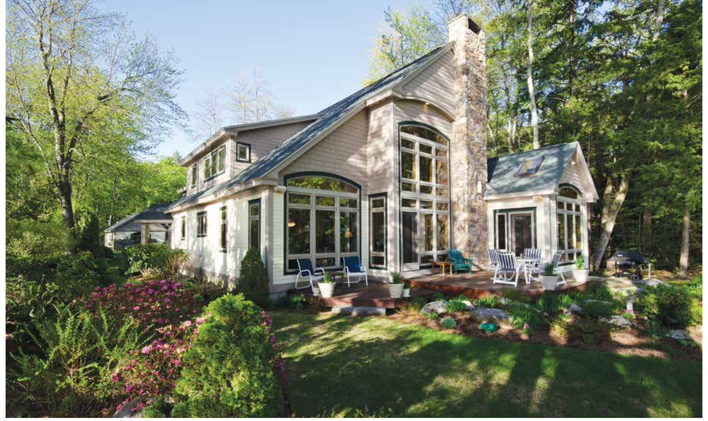
Fournier Builders LLC