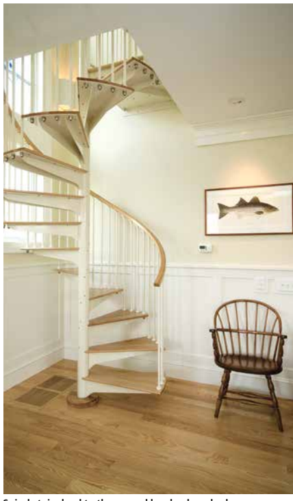
Spiral stairs lead to the second level, where bedrooms, bathrooms and a bar area are located.