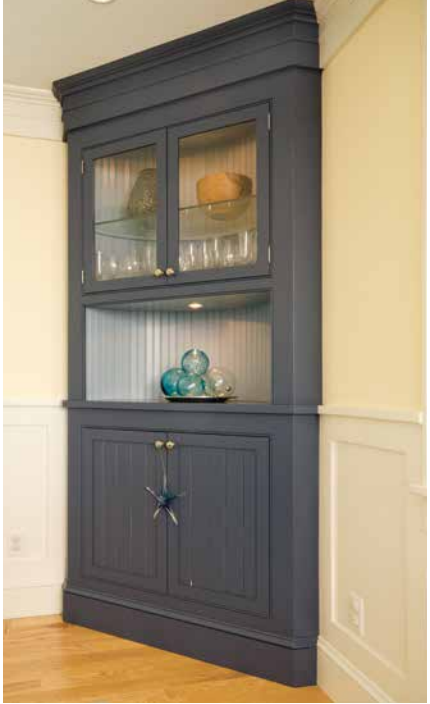
Custom-built cabinetry by Above Board Woodworks

"After repairing a client's roofing problem, which entailed ceiling and drywall replacement along with our usual job