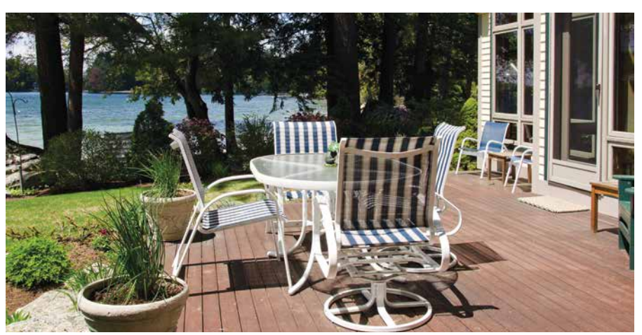
Relax on the deck and feel the breeze from the lake.

Adhering to the homeowner's wishes, top-of-the-line Pella windows were installed to seal out the harsh, winter lakefront winds.