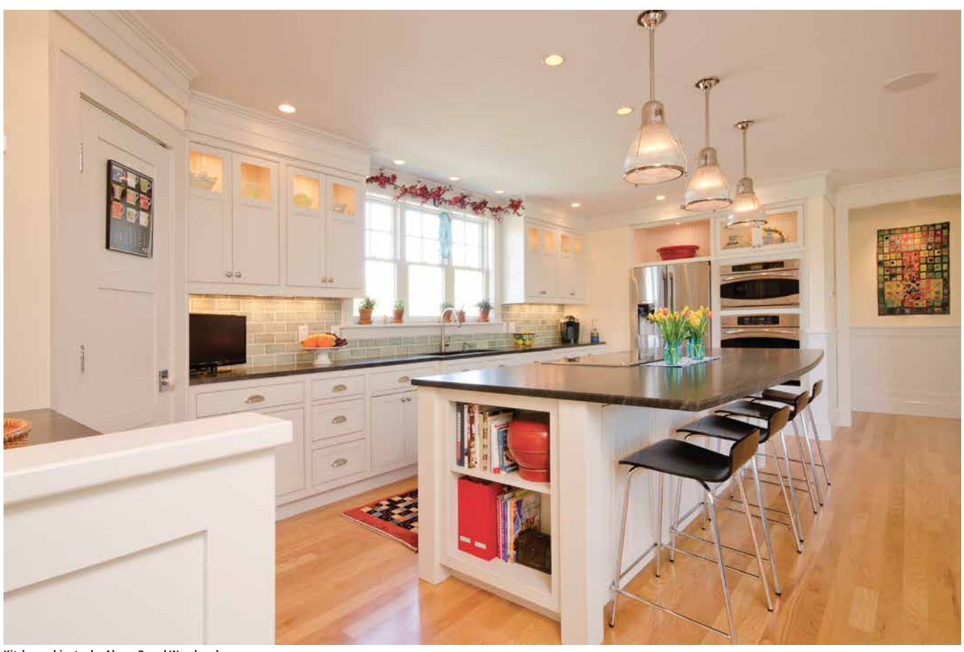
Kitchen cabinetry by Above Board Woodworks